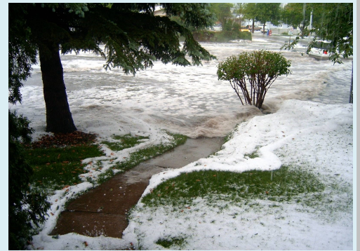
159 St.

As soon as the storm passed, I remember the street in front of our house was filled with water and much of the hail had gathered to form small icebergs floating down the avenue. There was an eerie mist rising above the water and I saw many of our neighbours for the very first time as